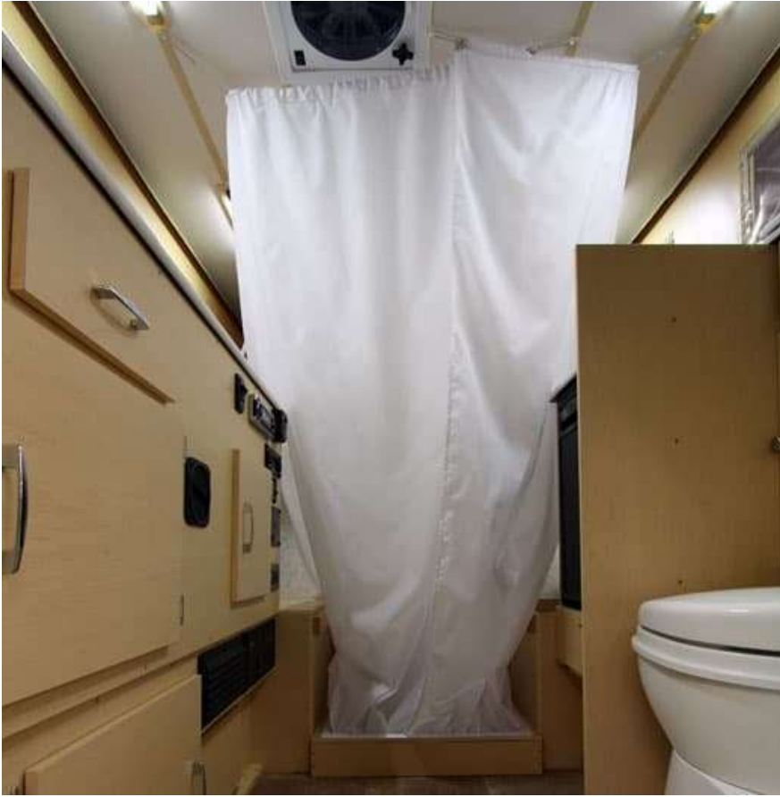
Above: The shower curtain closed for use