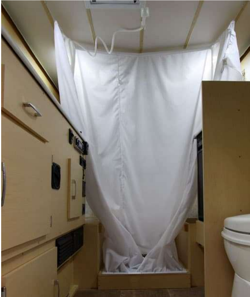
Above: The shower curtain attached above the shower pan and open for use